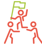
Team as a Service